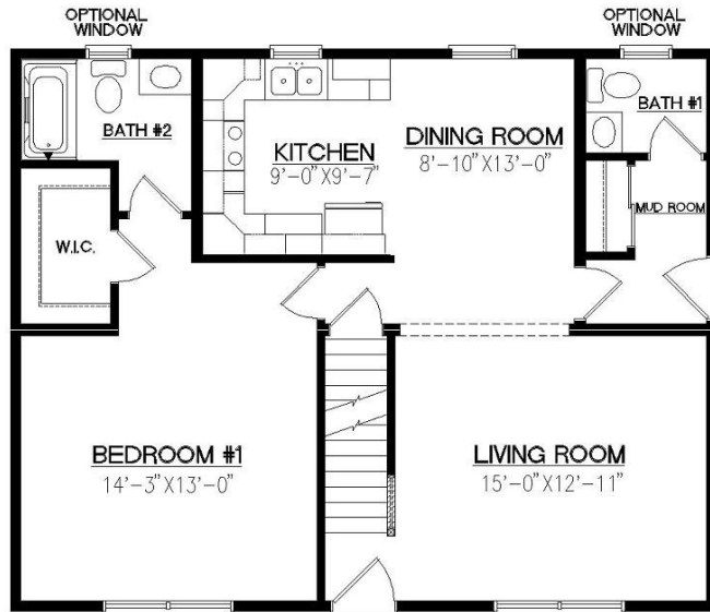
First Floor (w/ Basement)

Note: Renderings are for illustrative purposes only and may vary per series standard specifications.