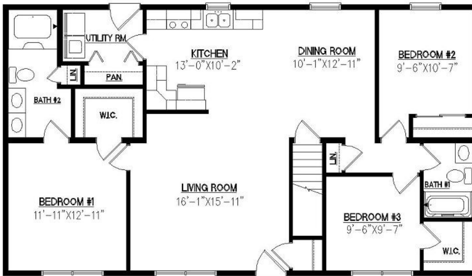
First Floor (w/ Basement)

Note: Renderings are for illustrative purposes only and may vary per series standard specifications.