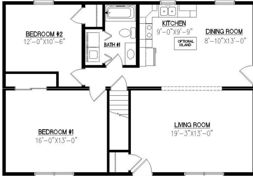
First Floor (w/ Basement)

Note: Renderings are for illustrative purposes only and may vary per series standard specifications.